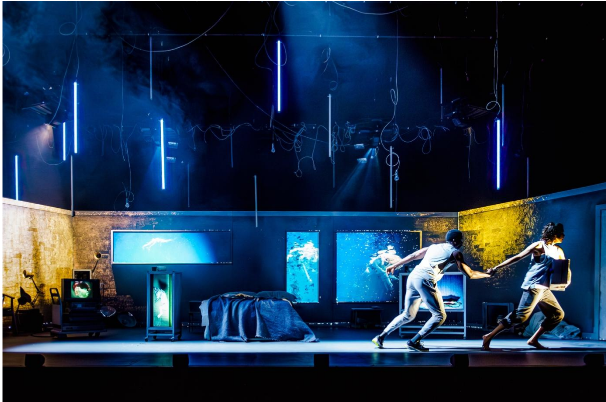
Frankenstein, 2024.

We like to challenge audiences to see things from a new perspective – stories, theatre, the world around them. You can get a flavour of this in our Showreel .