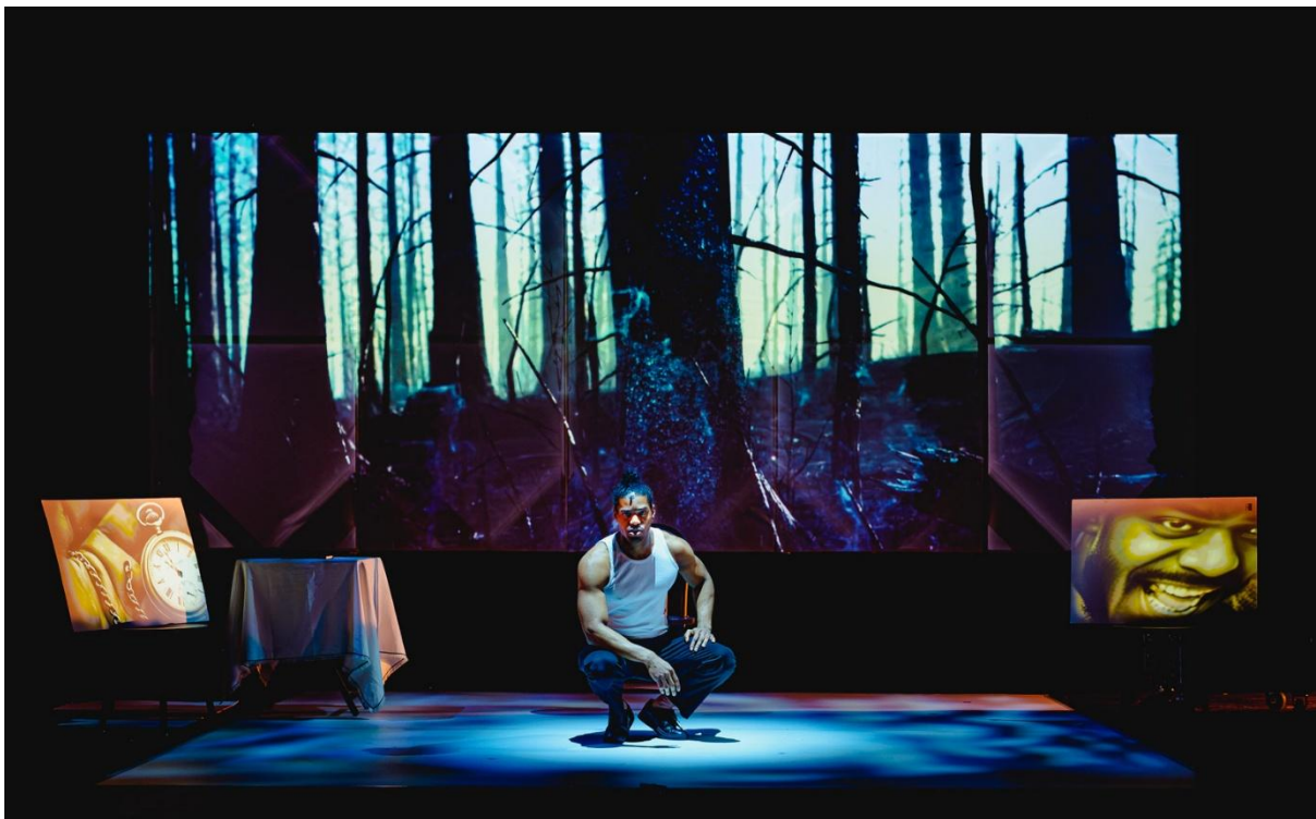
All Blood Runs Red, 2025.