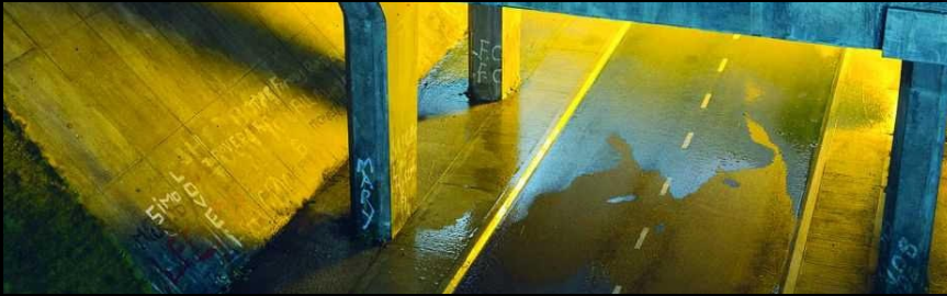
Dream English Kid, 1964–1999 AD 2015 (still) Courtesy of the artist © Mark Lecky