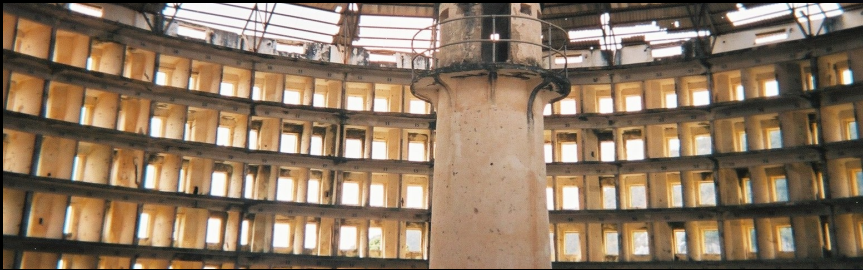
Inside one of the prison buildings at Presidio Modelo, Isla de la Juventud, Cuba.

Jeremy Bentham's Panopticon prison architecture, and Foucault's writing about it in Discipline & Punish: The Birth of the Prison , (1995)