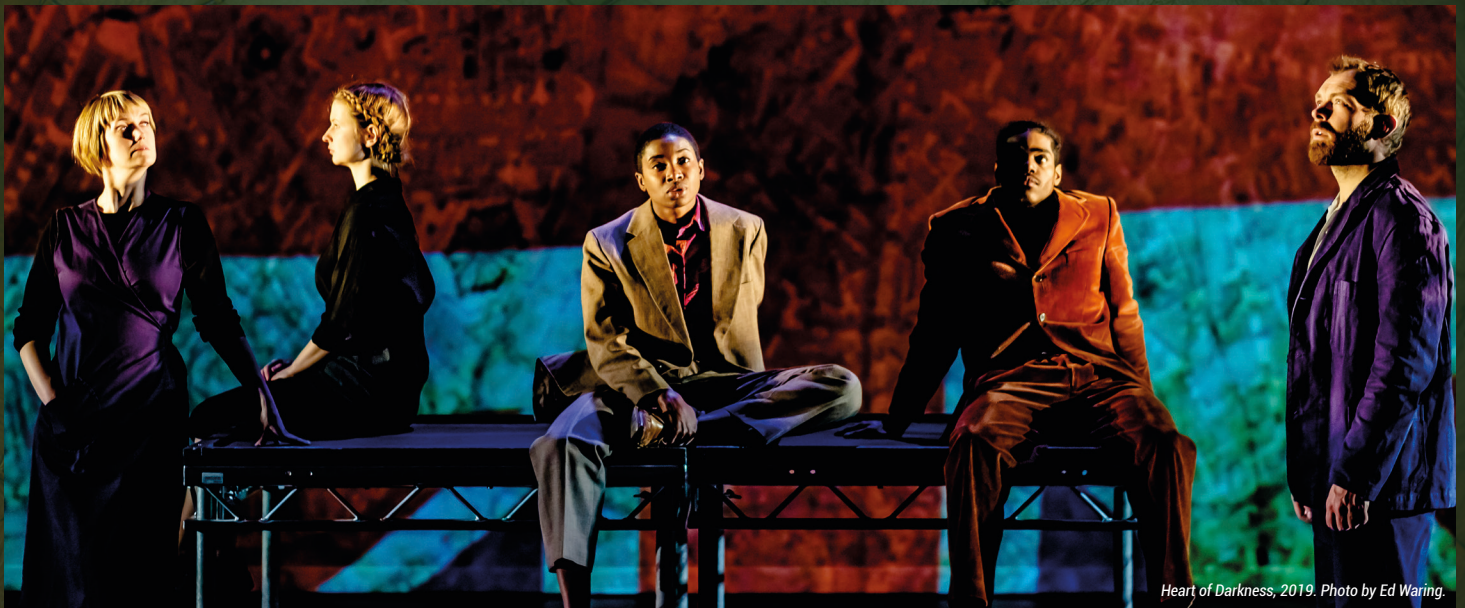
Heart of Darkness, 2019.

imitating the dog's bold adaptation of Mary Shelley's Frankenstein provides multiple opportunities for creative learning. Exploring the text via this innovative production provides an excellent opportunity for wider analytical reading and enriched understanding at GCSE, AS/A-level and undergraduate level across a number of subject areas, including Drama, Theatre Studies, English, Film Studies, Media Studies, Art, Design, Technology and more.